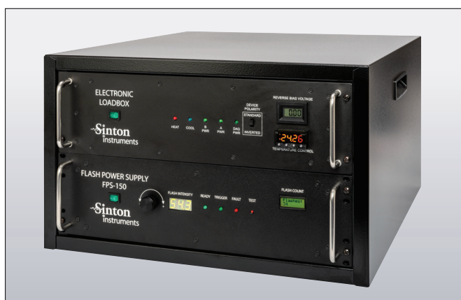
High throughput flash power supply and electronic load box.