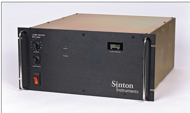
High-throughput flash power supply.