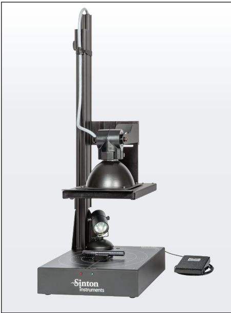
The Mini Boule Tester allows for quick characterization of the true bulk lifetime of miniature silicon boules using the transient PCD measurement method.

Simple and accurate contactless measurement of true bulk lifetimes on miniature silicon boules.