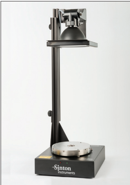
The WCT-120TS is an affordable, tabletop silicon lifetime and wafer metrology system.

Wafer measurement instrument offering calibrated analysis of temperature-dependent carrier-recombination lifetime.