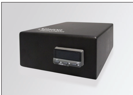
WCT-120TS temperature control box.