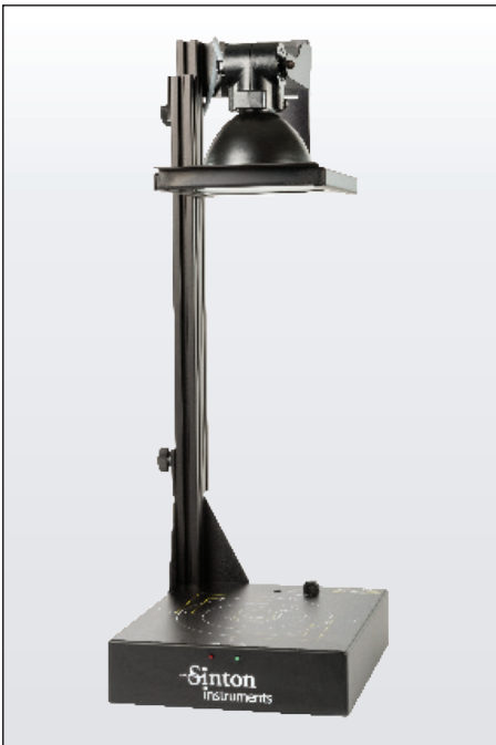
The WCT-120 is an affordable, tabletop silicon lifetime and wafer metrology system, suitable for both device research and industrial process control.

The wafer measurement instrument offering the best available calibrated analysis of carrier recombination lifetime. Fully compliant with SEMI Standard PV-13.